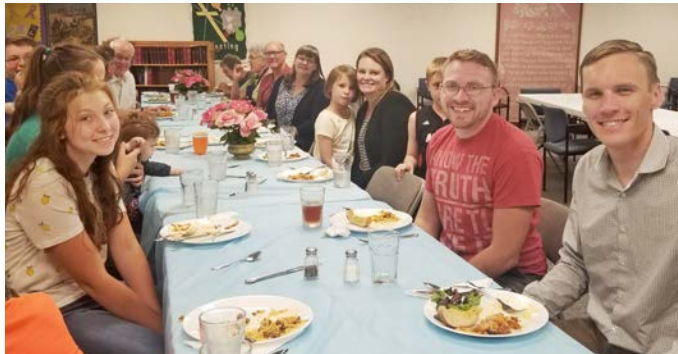
New pastors and their families enjoy a spaghetti luncheon provided by Messiah's LWML Guild.

Lutheran Church and School of Messiah, Grand Junction, Colo., hosted the Rocky Mountain District Post-Seminary Applied Learning and Support