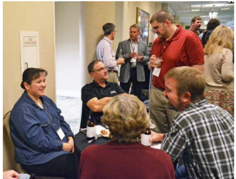
Participants enjoy fellowship at the 2016 National RSTM Conference.

We are happy to report that we are again making the snazzy Reaching Rural America for Christ polos available for purchase! Wouldn't you like to sport one of the stylish RSTM Reaching Rural America for Christ polos? Order by contacting our office by Oct. 13 and you can pick up your shirt at