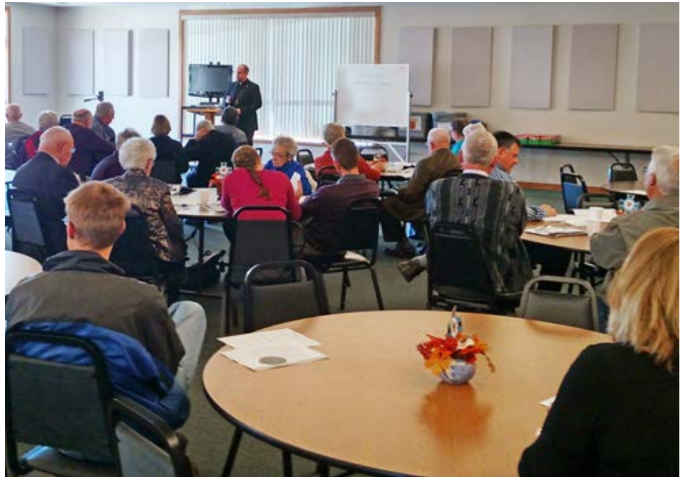
Sunday morning adult bible study at Faith Lutheran Church

(διδάσκω) is a biblical Greek word for the kind of formal instruction at which Lutherans have historically been pretty adept. (οικοδομή) is the kind of teaching and learning we experience when we share life together. In 1 Thess. 5:11, Paul talks about "encouraging each other